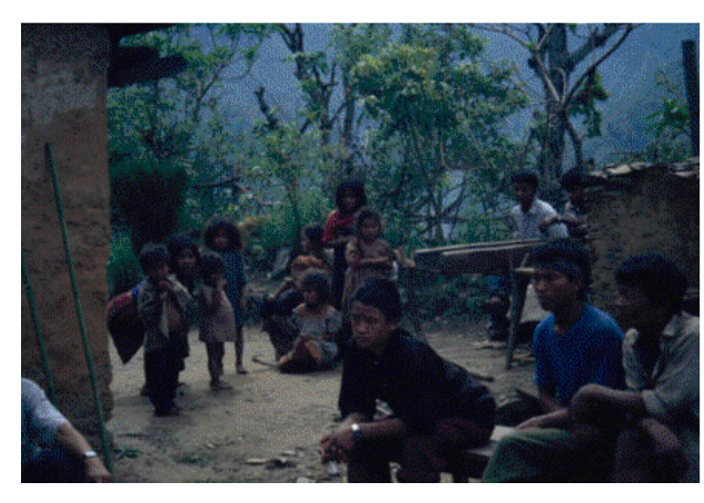
Figure 1: Chepang people training in the Kandrang Valley with an oil expeller in the backgound.

The Chiuri tree is a medium sized tree native to Nepal. It grows mainly in the sub-Himalayan tracts on steep slopes, ravines and cliffs at an altitude of 400 to 1400 meters, particularly in the Chitawan district. Its botanical name is Diploknema butvracea Roxb syn. Bassia butyracea, syn. Madhuca butyracea, syn. Aesandra butyracea). It is also named "butter tree". The main product of the tree is "ghee" or butter, extracted from the seeds and named "Chiuri ghee" or "Phulwara butter".